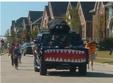
Giant Fudala Spider leads the 2005 Costume Parade through Turnbridge Manor.

Please help keep our community safe and attractive. Thank You.