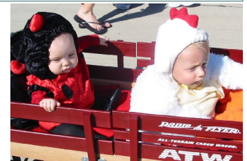
Even our smallest residents can't resist a parade!

bounce house, and inflatable slide were a big hit with the kids while the adults competed in a pie baking contest and a chili cook-off! The Social Committee is working hard to make this year's Festival the best ever, so be